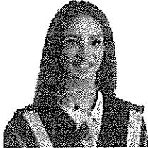
Office of the Mayor, Councillor Jami Kilisaris